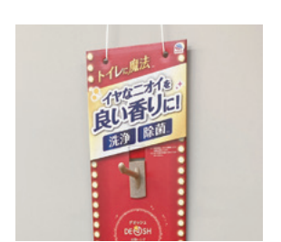
Hook made from scallop shell powder

resources efficiently, sort and reduce waste, and improve transportation efficiency.